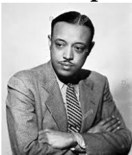
William Grant Still