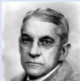
William Lyon Phelps