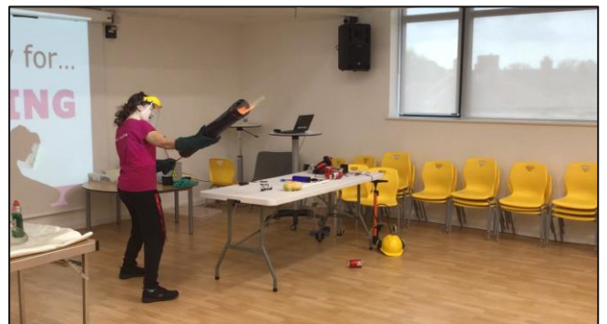
Can you see the rocket leaving the tube?