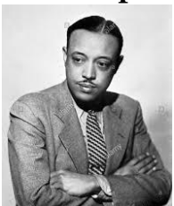
William Grant Still